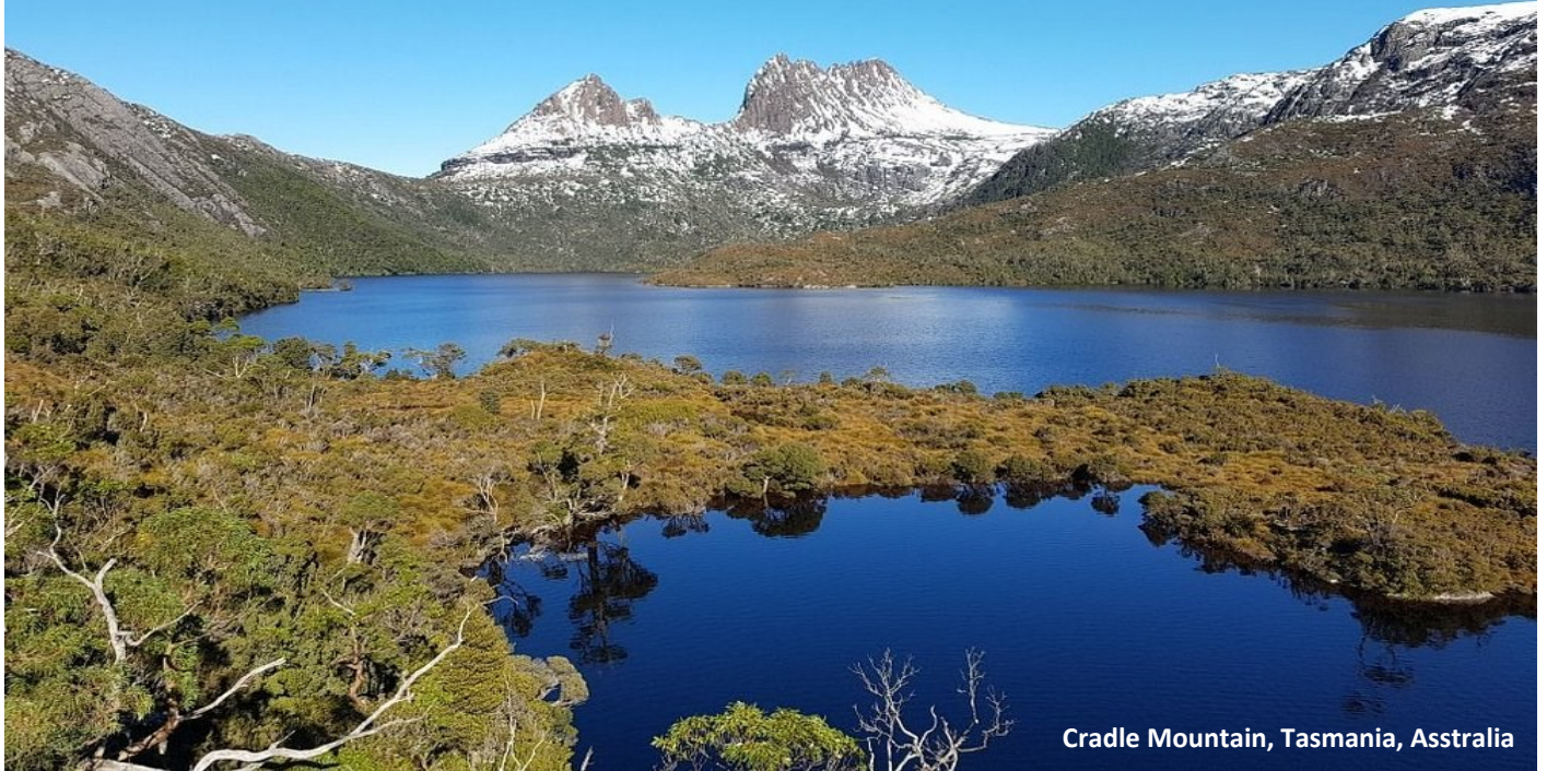
Cradle Mountain, Tasmania, Asstralia

And, behold, thou shalt conceive in thy womb, and bring forth a son, and shalt call his name Jesus. He shall be great, and shall be called the Son of the Highest: and the Lord God shall give unto him the throne of his father David: And he shall reign over the house of Jacob for ever; and of his kingdom there shall be no end. Luke 1:31-33 (KJV)