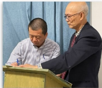
Signing on the Tenets of HCBC's Belief