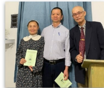
Receipt of Membership Booklet after a Hearty Amen

Thank God their four children, though had been taught on the Truth since very young, were intrigued by parents' decision on membership. They were not truly saved or born-again then. After listening to the True Gospel again, they began to be intrigued with the truth in Romans 10:9-10 . They almost immediately repented of their sins and prayed to God and asked Christ Saviour to washed their sins white as snow. After salvations, they started to ask me about baptism.