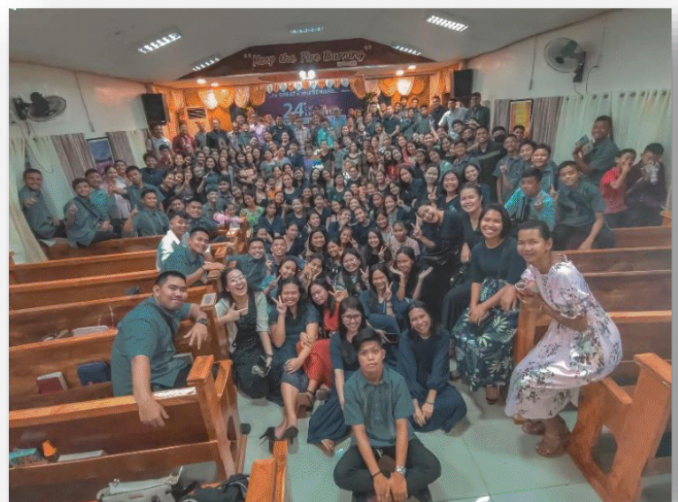
Taken later in the evening of our 24 th Church Anniversary