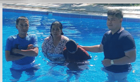
Taken during our Mission Emphasis Month in November 2022