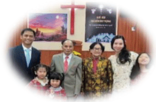
Image notes in order: My family with my parents; Jclub-teamwork; Christmas evangelist night; Ninh Thuan children ministry; baptism, 2 souls got saved; students of Victory life

Prayer requests: God's strength, guidance and financial provision; 2 English teachers and Work Permits for 2 current teachers. Thank you so much and God bless you all