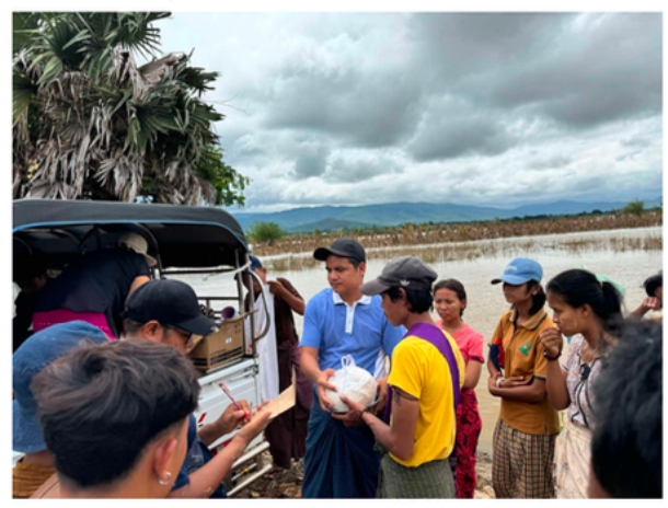
One of the area we distributed gospel tracts and relief goods