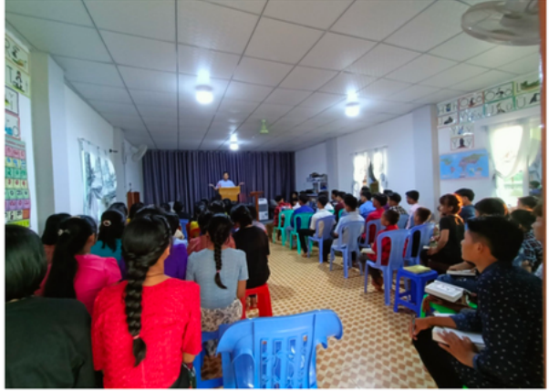
60 senior high students attended in our Sunday Evening Service.

Sending Church: BETHANY BAPTIST CHURCH Makati City, Philippines