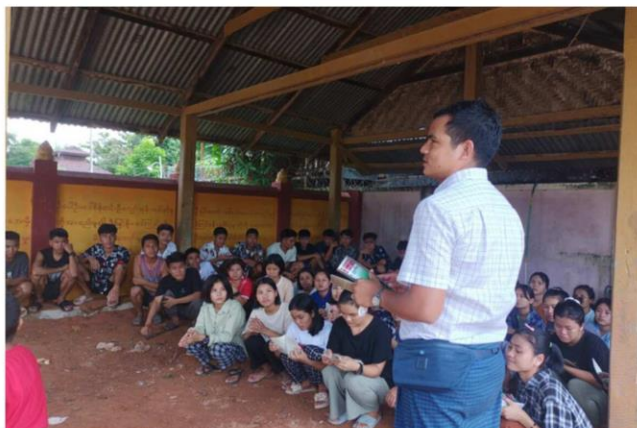
Distribution of relief goods with gospel tracts and pray for the senior high students affected by the flood.