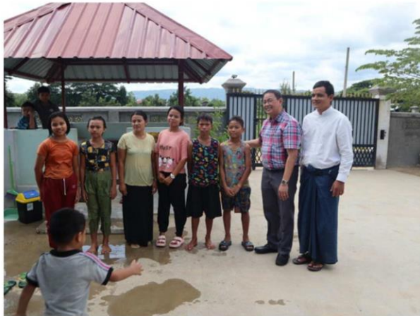
Pastor Nable baptized 6 souls.