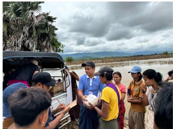
One of the area we distributed gospel tracts and relief goods.