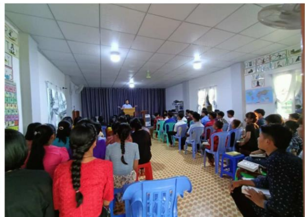
60 senior high students attended in our Sunday Evening Service.

Sending Church: BETHANY BAPTIST CHURCH Makati City, Philippines